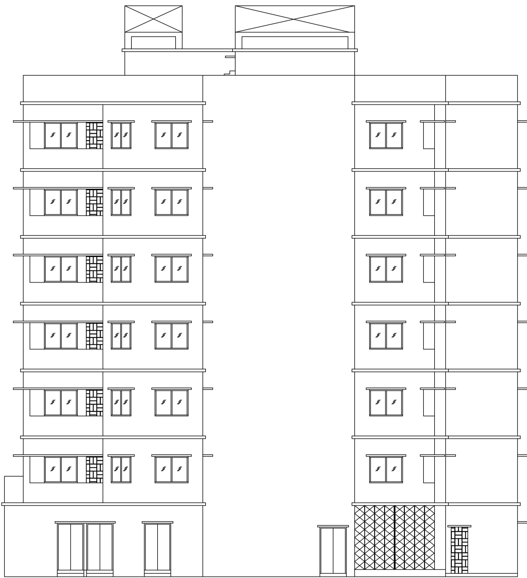
FRONT ELEVATION BLOCK-A SCALE:- 1 : 100

Digital Signature of Executive Engineer(Civil)/Building Deptt./Borough-IV